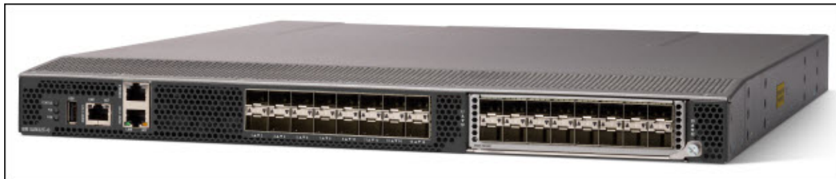
Figure 1. IBM Storage Networking SAN32C-6

Small scale SAN architectures can be built by using a low cost, non-blocking, line rate, and low latency fixed stand-alone SAN switch that connects both storage and host ports. Medium to large-scale SAN architectures that are built with SAN core directors can expand 32-Gbps connectivity to the server rack by using these switches either in switch mode or Network Port Virtualization mode. Additionally, investing in this switch in the server rack provides a first day option of upgrading to 32-Gbps server connectivity using the 32-Gbps HBAs that are already available in the market.