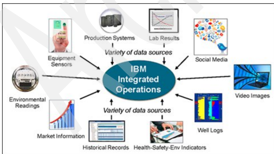
Figure 1 - The Integrated Operations solution receives data from a variety of sources

The solution combines some powerful IBM offerings, including IBM Integration Bus Manufacturing Pack to integrate data from sources such as field-based sensors, IBM InfoSphere® Streams to process the data in real time, and IBM Intelligent Operations Center to integrate, model, and monitor the data for analysis. IBM Predictive Maintenance and Quality analyzes and scores the data and provides recommendations, while IBM InfoSphere BigInsights™ finds new insights in volumes of structured and unstructured data.