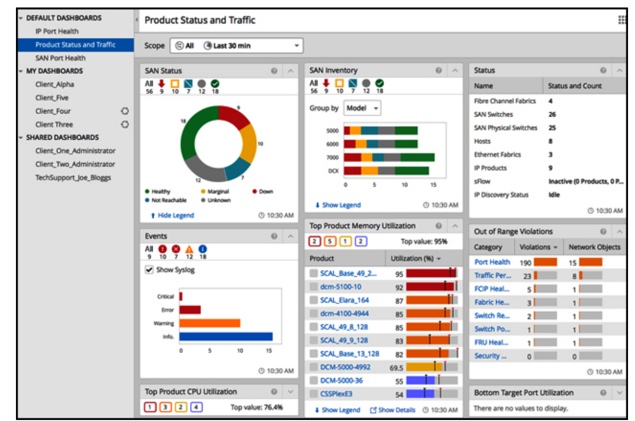
Figure 1 shows the customizable IBM Network Advisor SAN dashboard.