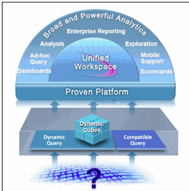
Figure 1. IBM Cognos Dynamic Query integrated into the Cognos BI stack

Figure 1 illustrates how the Cognos Dynamic Query layer is integrated into the Cognos BI stack.