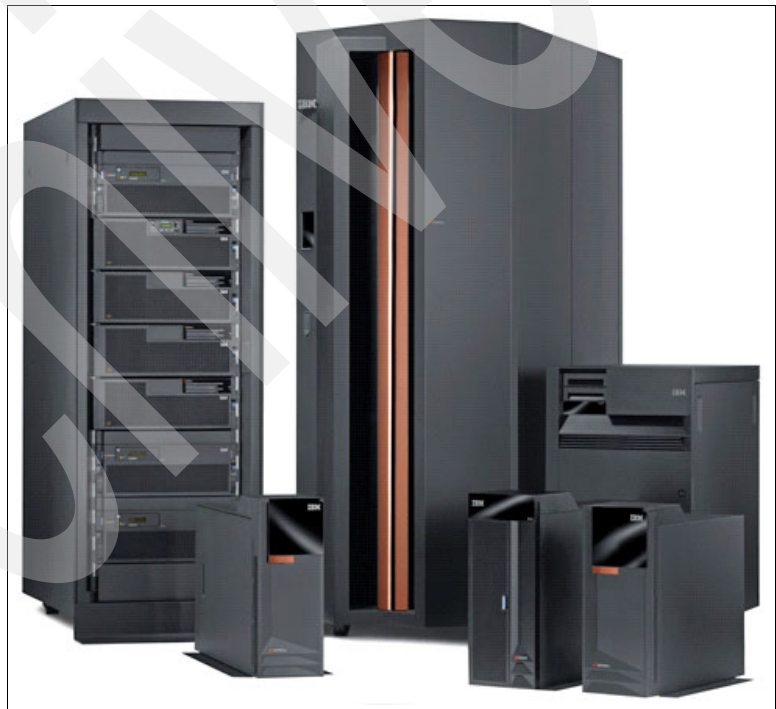
Figure 1-1 The IBM @server iSeries system

The regulations also require financial institutions to provide greater detail about the stability of the institution and the risks to shareholders.