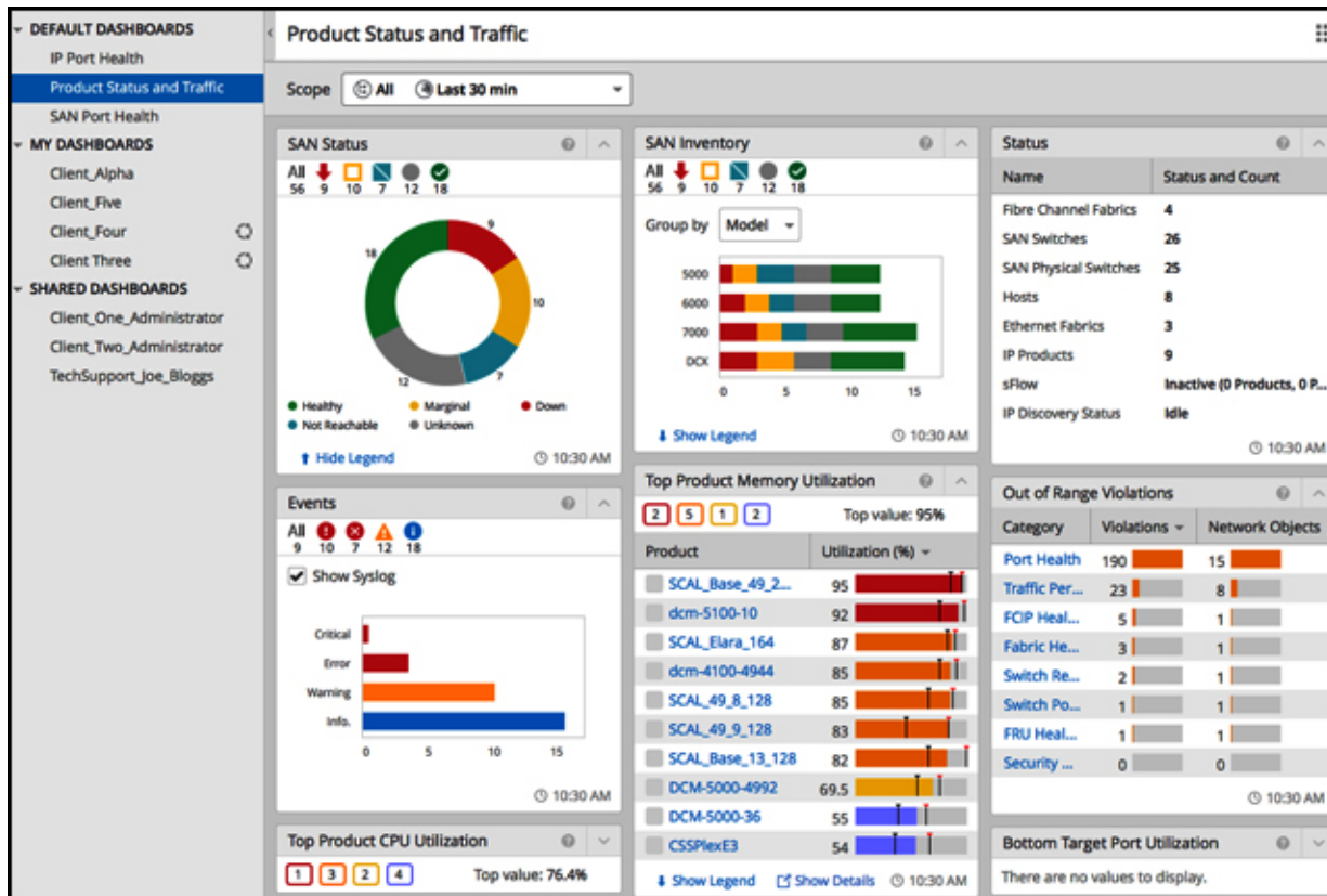
Figure 1. Customizable IBM Network Advisor SAN dashboard (web client view)

Figure 1 shows the customizable IBM Network Advisor SAN dashboard.